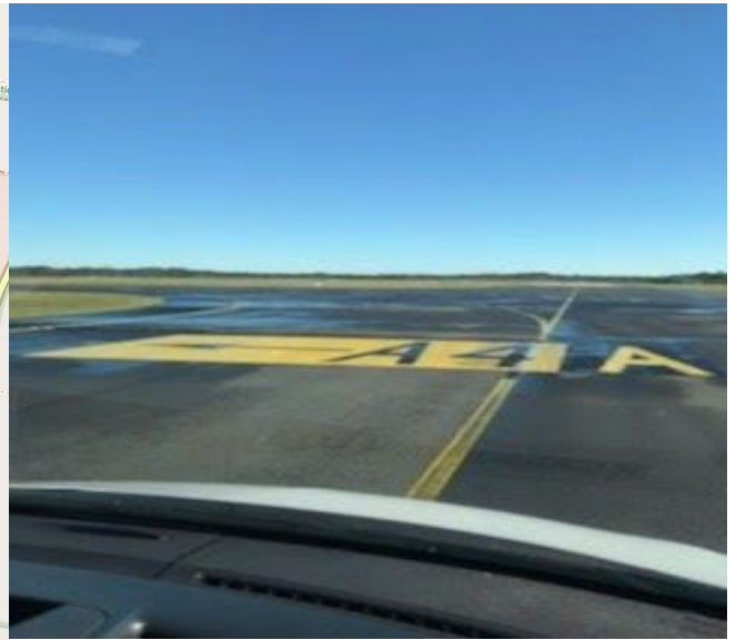
Figure 3 – New 'Information Markings'

It is crucial for all aircrew to be aware of these changes and have a deep understanding of the layout in order to prevent confusion and further occurrences. For further information or to provide feedback or suggestions on alternative methods to improve safety within Newcastle Airport, please contact: