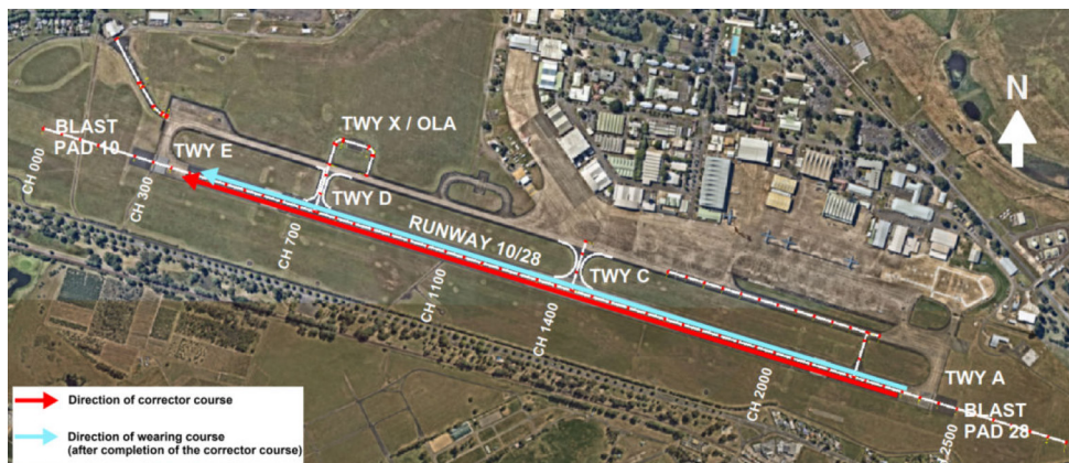
Diagram 2 outlines the area and scope of works to be undertaken on Phase 2 (Corrector Course) and Phase 3 (Wearing Course) of the construction works. Directions are general only and may be changed due to operational requirements.